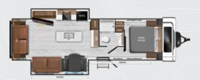
LENGTH 34′11″ | HEIGHT 11′6″ | SLEEP CAPACITY 5-6 HITCH 1,114 lbs. | DRY 7,566 lbs. | GVWR 9,914 lbs.