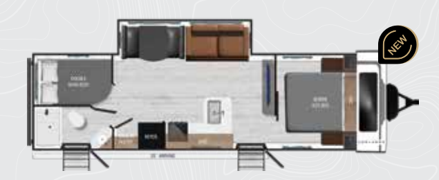
LENGTH 31'11" | HEIGHT 11'6" | SLEEP CAPACITY 9+ HITCH 940 lbs. | DRY 6,418 lbs. | GVWR 9,740 lbs.