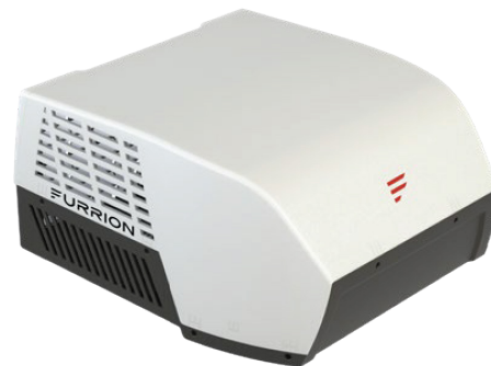
FURRION CHILL™ 18K BTU "WHISPER QUIET" CHILL® CUBE VARIABLE SPEED ROOFTOP AIR CONDITIONER LARGEST AIR CONDITIONING SYSTEM IN OUR CLASS!