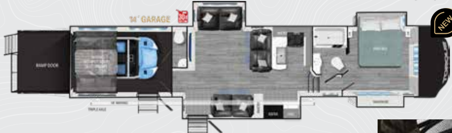
424 LENGTH 46' 9" | HEIGHT 13' 3" CARGO CAPACITY 5,935 LBS | DRY WEIGHT 15,017 LBS GVWR 21,000 LBS | SLEEPS 7-8