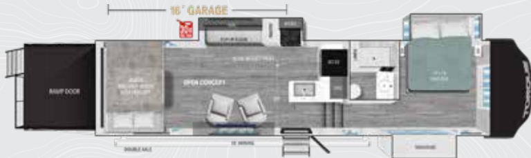
371 LENGTH 42' 11" | HEIGHT 13' 3" CARGO CAPACITY 2,807 LBS | DRY WEIGHT 14,145 LBS GVWR 17,000 LBS | SLEEPS 7-8