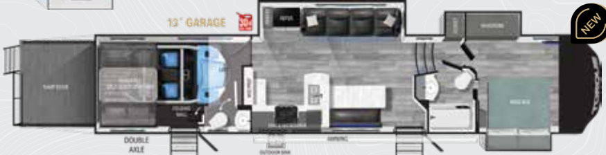
316 LENGTH 36' 2 3/4" | HEIGHT 13' 3" CARGO CAPACITY 5,148 LBS | DRY WEIGHT 11,479 LBS GVWR 16,675 LBS | SLEEPS 5-6